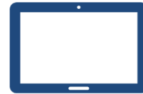
iPad or phone