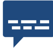
With a script