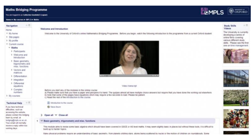
Figure 1 The introductory page of the maths course

The MPLS (Mathematical, Physical and Life Sciences) Division's Bridging Programme arose from the need for incoming students in the physical sciences to have certain prerequisite knowledge in mathematics and in their science subject. A one-week residential programme was established in 2012, involving a mixture of academic (subject-specific) sessions and transitional support (eg study skills) sessions. Places are prioritised for students who have a particular need: for example, if they have been identified in the admissions process as coming from socially and educationally disadvantaged backgrounds, if they have a disability, or there are other good reasons why they might be in need of such a course.